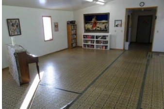
We finally put in the new floor!